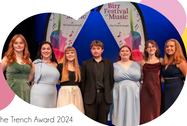
The Trench Award 2024